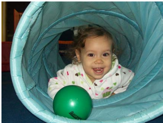
Czarina age 6 months